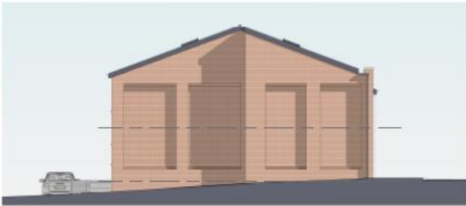
PROPOSED SIDE ELEVATION 1 : 100