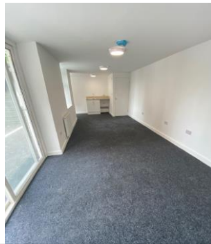
OFFICE 3 – 25 SQ.M