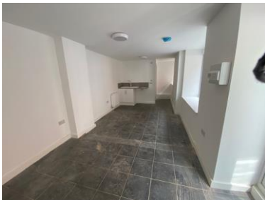
OFFICE 2 – 20 SQ.M