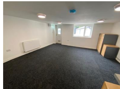
OFFICE 4 – 30 SQ.M