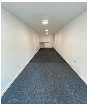
OFFICE 9 – 25 SQ.M