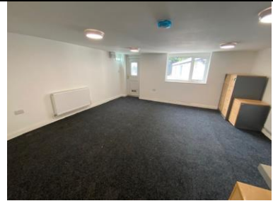
OFFICE 4 – 30 SQ.M