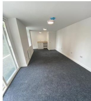
OFFICE 3 – 25 SQ.M