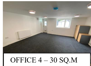
OFFICE 4 – 30 SQ.M