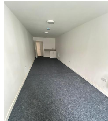
OFFICE 10 – 27 SQ.M